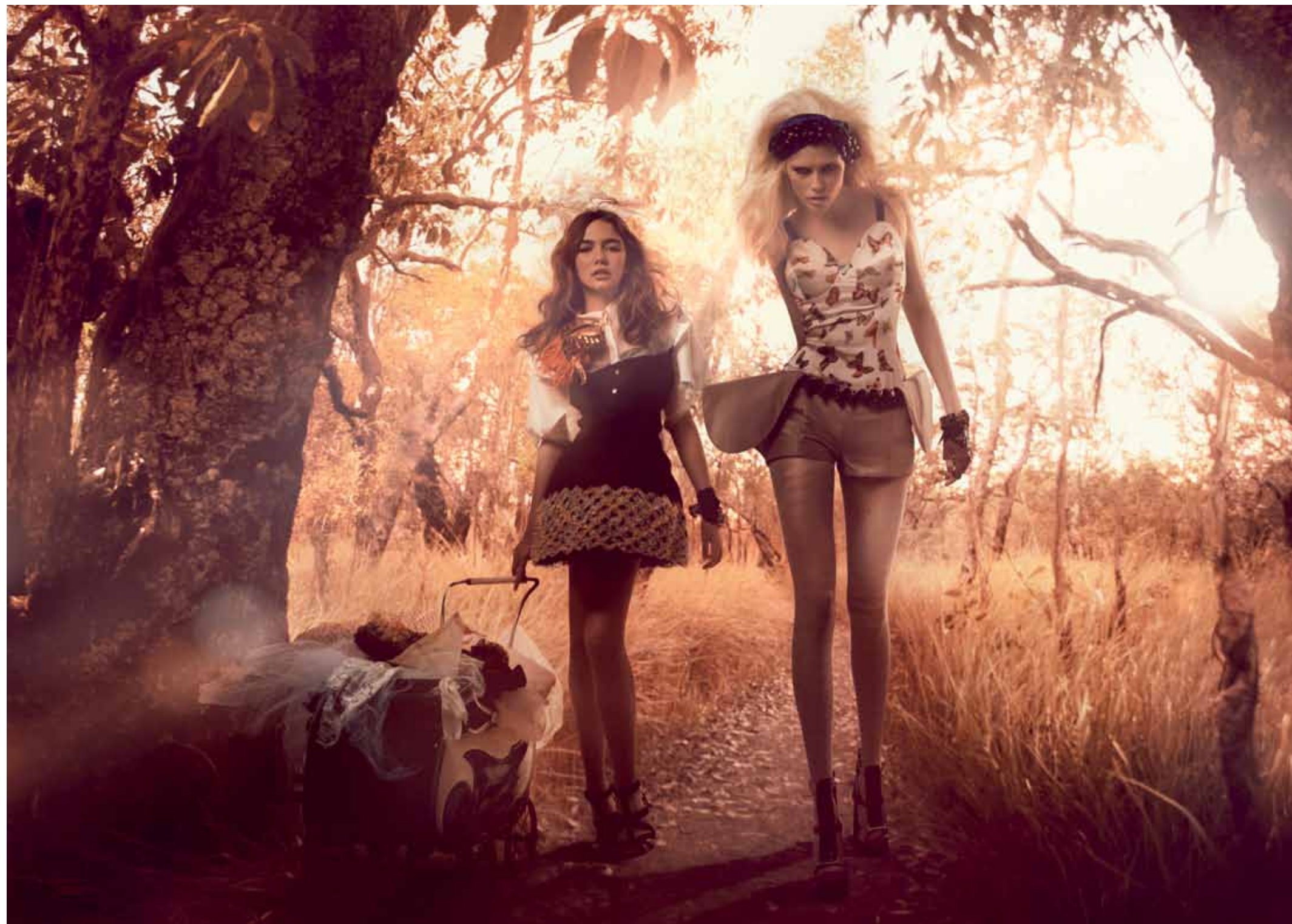
Skirt MANOUSH Blouse TSUMORI CHISATO Broach MANISH ARORA Sandals BENOIT MELEARD