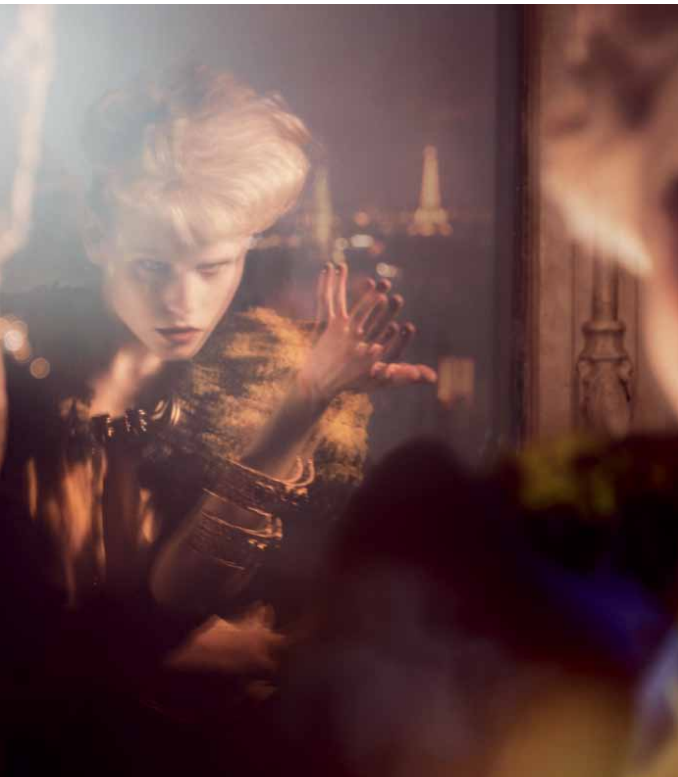
Jacket ATELIER CHARDON SAVARD Necklace & bracelet DOMINIQUE AURIENTIS